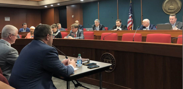
Presentation of the FY19 Update to the TFA 10 Year Plan